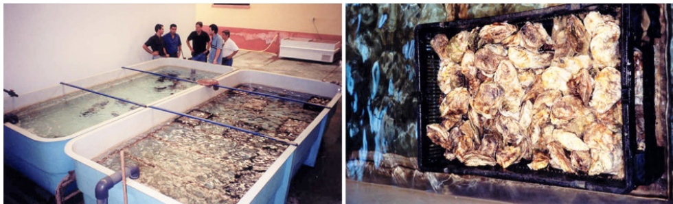
View of depuration tanks (left) and oysters during the process (right), at a depuration facility in Europe.