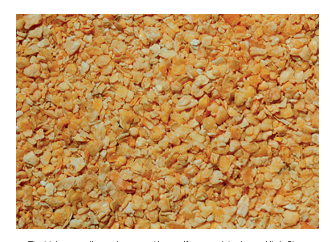
The highest-quality soybean meal has uniform particle size and little fiber.

Virtually all the meal produced in the U.S. is dehulled before oil extraction, which brings the crude fiber content down from around 7 percent to about 3 percent. Fiber is then added back to the meal when a customer specifies 44 percent meal. Meal with the lowest possible fiber content and highest protein content should be specified for aquaculture. The cellulose in soybean hulls is not digestible to fish and will degrade the pellet quality and water stability of finished feed.