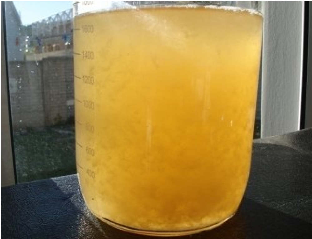
Biofloc in suspension (above) and biofloc settled after 10 minutes (below).