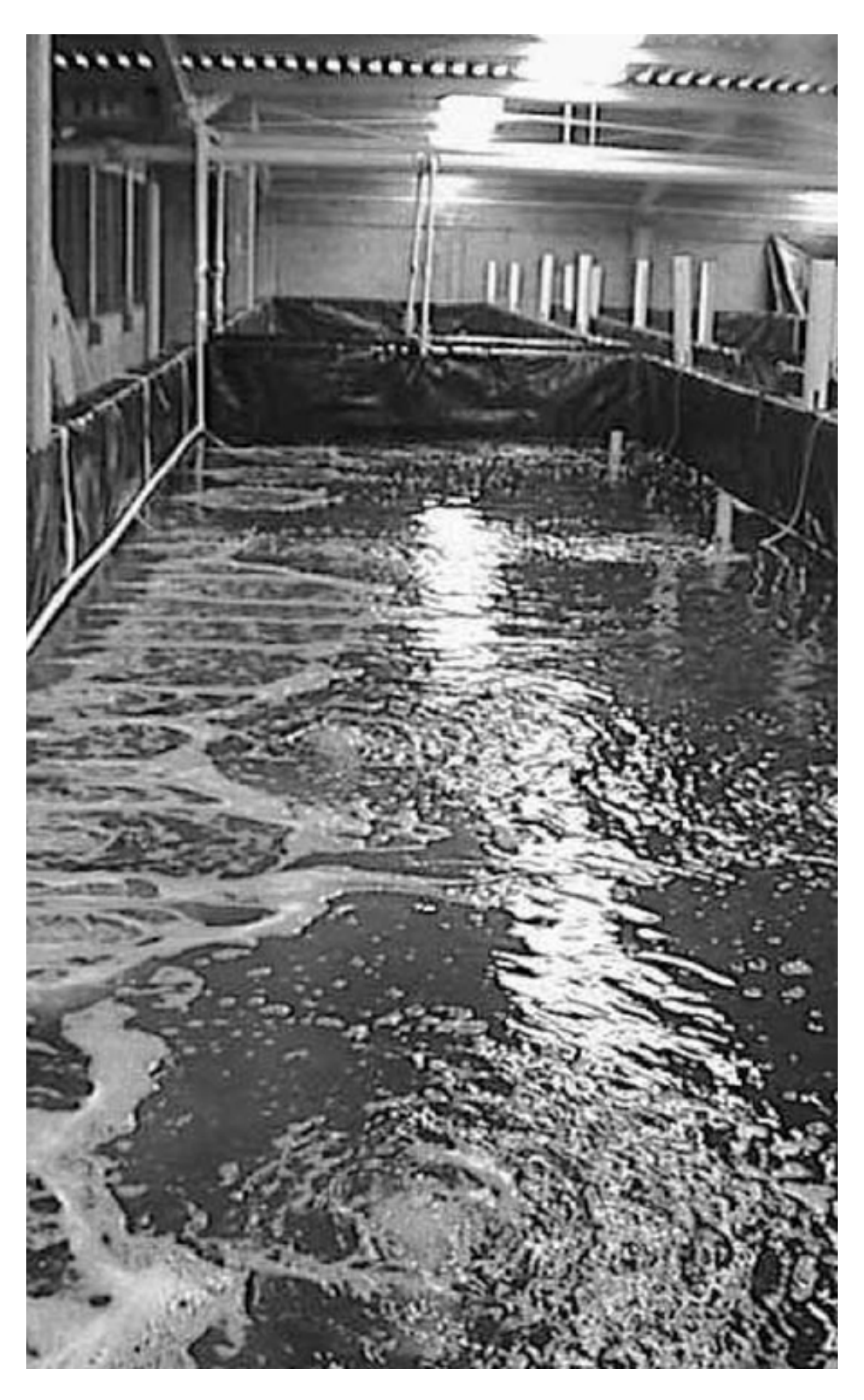
Recirculation improves water quality and provides greater chemical stability.