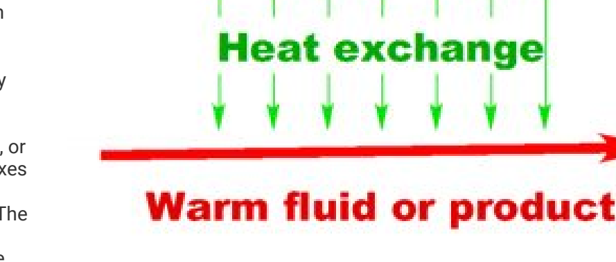
Fig. 1. Illustration of the basic principle of the freezing technique.

Other techniques are also used, but they are still very confidential because the operational costs are too high as they involve cryogenics using liquid nitrogen, or are not as well suited to freeze thick boxes as the impingement freezers, which are very efficient for IQF but not for boxes. The impingement freezers are adequate for thin layers of product, but when they are too thick, the process does not work