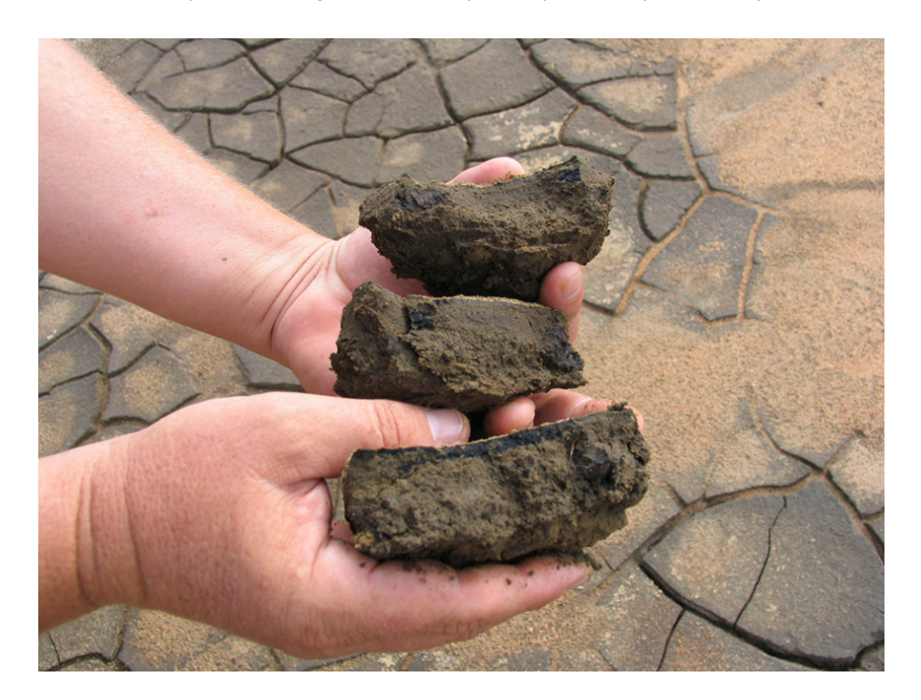
Bacteria – ubiquitous in terrestrial and aquatic habitats as spores, resting cells, or actively growing cells – are the primary organisms of decay in an aquaculture system, including its organic matter.

In aquaculture, organic matter is applied to ponds directly in manures (animal dung, grass and agricultural waste) and feed. It also is produced through photosynthesis by phytoplankton and other aquatic plants. These plants die and their remains become dead organic matter.