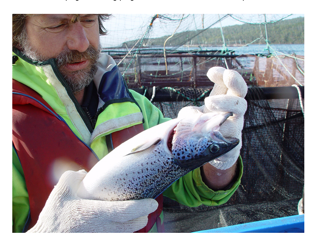
Breeding for resistance to amoebic gill disease is a key objective. Data is collected by inspecting approximately 2,000 fish for gill lesions during marine grow-out.

A unique selective-breeding program developed for Australia's $330 million Tasmanian Atlantic salmon industry is predicted to result in ongoing reductions in production costs.