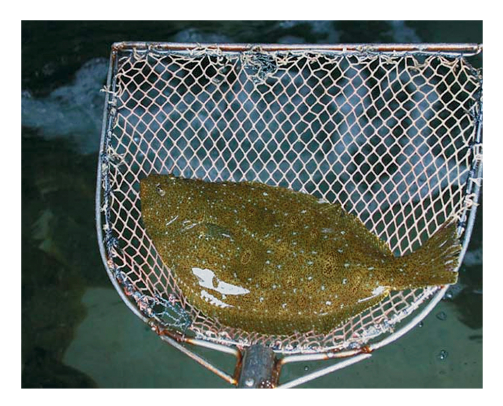
Organic acid supplements can help improve the health of olive flounders, an important commercial species in Asia.

Olive flounder ( Paralichthys olivaceus ) is a commercially important species of flatfish that is farmed in Korea, China and Japan. It is estimated that approximately 50,000 metric tons (MT) per year of this species are raised in Korea, making the country the most important producer.