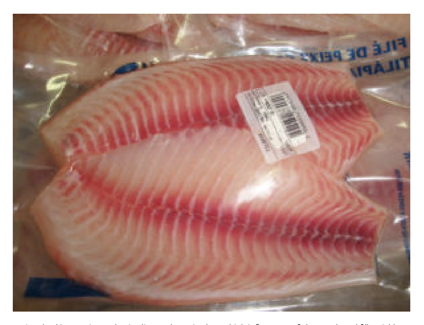
Involved in protein synthesis, dietary threonine has a high influence on fish growth and fillet yield.