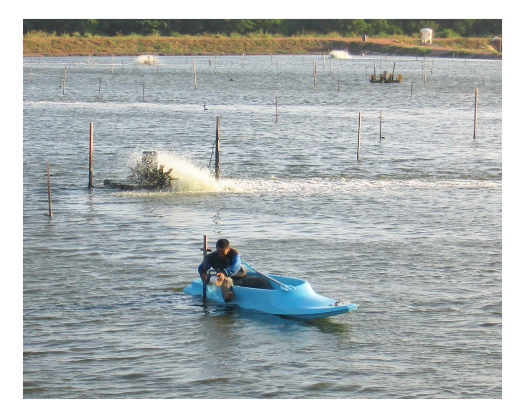
Good management practices can help farms avoid disease problems.

It is rather extraordinary to find data that relate environmental and culture practices to disease outbreaks for a wide geographic area. One of these rare occasions has been made possible by Aquatec, a leading commercial shrimp hatchery in Brazil.