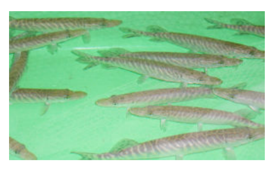
Like their larval form, adult northern pike are voracious eaters.

In a study, the early weaning of pike larvae from artemia nauplii to a commercial trout starter resulted in very good survival and growth in both fresh and saline water. These results were comparable to those of larvae continuously fed artemia. In general, growth and survival were slightly better in saline than freshwater. Growth was also more homogenous in saline water.