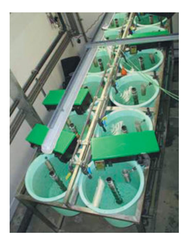
Recirculating system used in the study.