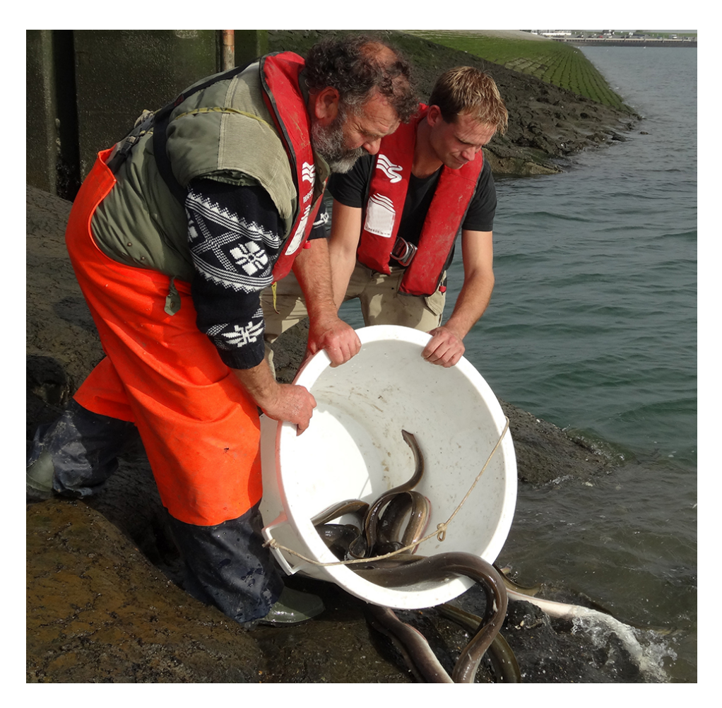
Mature eels are stocked "over the dike" in the sea.

As one of the most technologically advanced forms of aquaculture in the world, eel farming saw an initial rapid growth in production up to the early 2000s. In the past decade, however, the industry has been facing a series of challenges that could damage its future outlook. Farmers are now striving to find new ways to secure the future of European eel production in a more sustainable way.