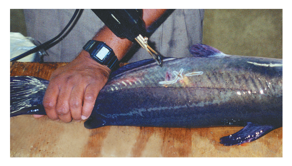
Fig. 2: Individual fish were branded for identification in the broodfish study.

Broodfish achieve a major portion of their growth during the postspawning phase of their life cycle. In the tests, 3year-old broodfish that spawned in spring were subjected to postspawning feeding one, three, and five times a week to satiation with 36 percent-protein commercial catfish feed. All treatments were handled equally during the prespawning and spawning phases of the study.