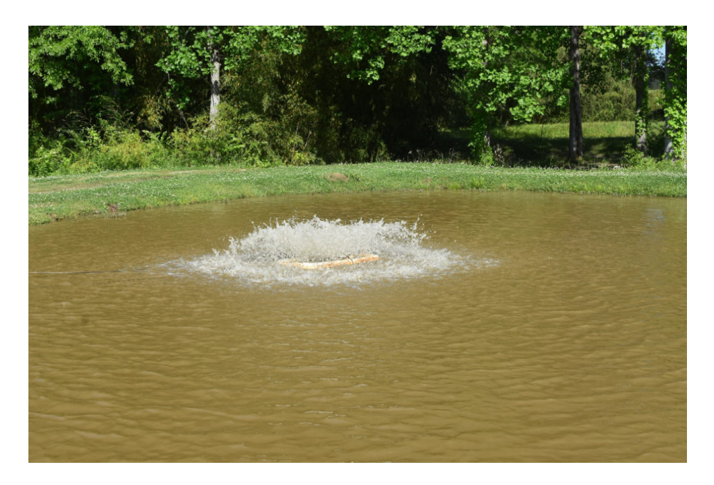
One of the 0.5-hp Air-O-lator aerators used in this study, showing water being splashed into the air during operation.

Pond aquaculture is becoming increasingly intensive. Resultingly, more feed is used, which results in a large oxygen demand. Water exchange can be used to avoid low dissolved oxygen concentration (DO), but it is more efficient to apply mechanical aeration.