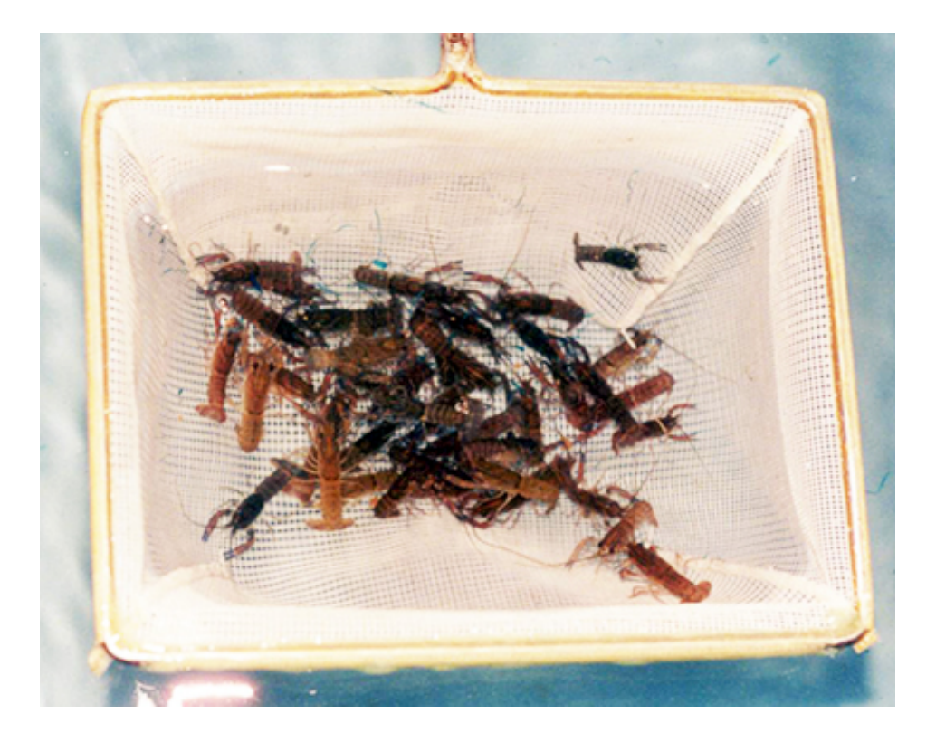
Selected groups of juvenile redclaws were distributed in the test tanks.

Each diet was prepared by mixing all macro- and microingredients (vitamin premix, mineral premix, choline chloride and calcium carbonate) in a food mixer. Fish oil and soy lecithin were homogenized and added to the mixture, along with sufficient water to provide 30 percent of ingredient weight.