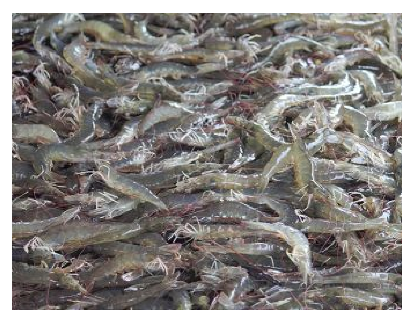
AHPND is a major global disease of farmed shrimp that seriously affects the industry in many countries in Asia and Latin America.