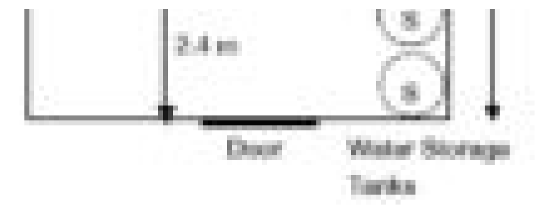
Fig. 1: Diagram of copepod production systems showing 1,000-L growout tanks (G), 2,200-L egg production tanks (E.P.), 150-L egg collection tanks (C) and 2,600-L water storage tanks. Separate salt-mixing and water storage tanks are located outside the building.

Large-scale production system for copepods « Global Aquaculture Advocate