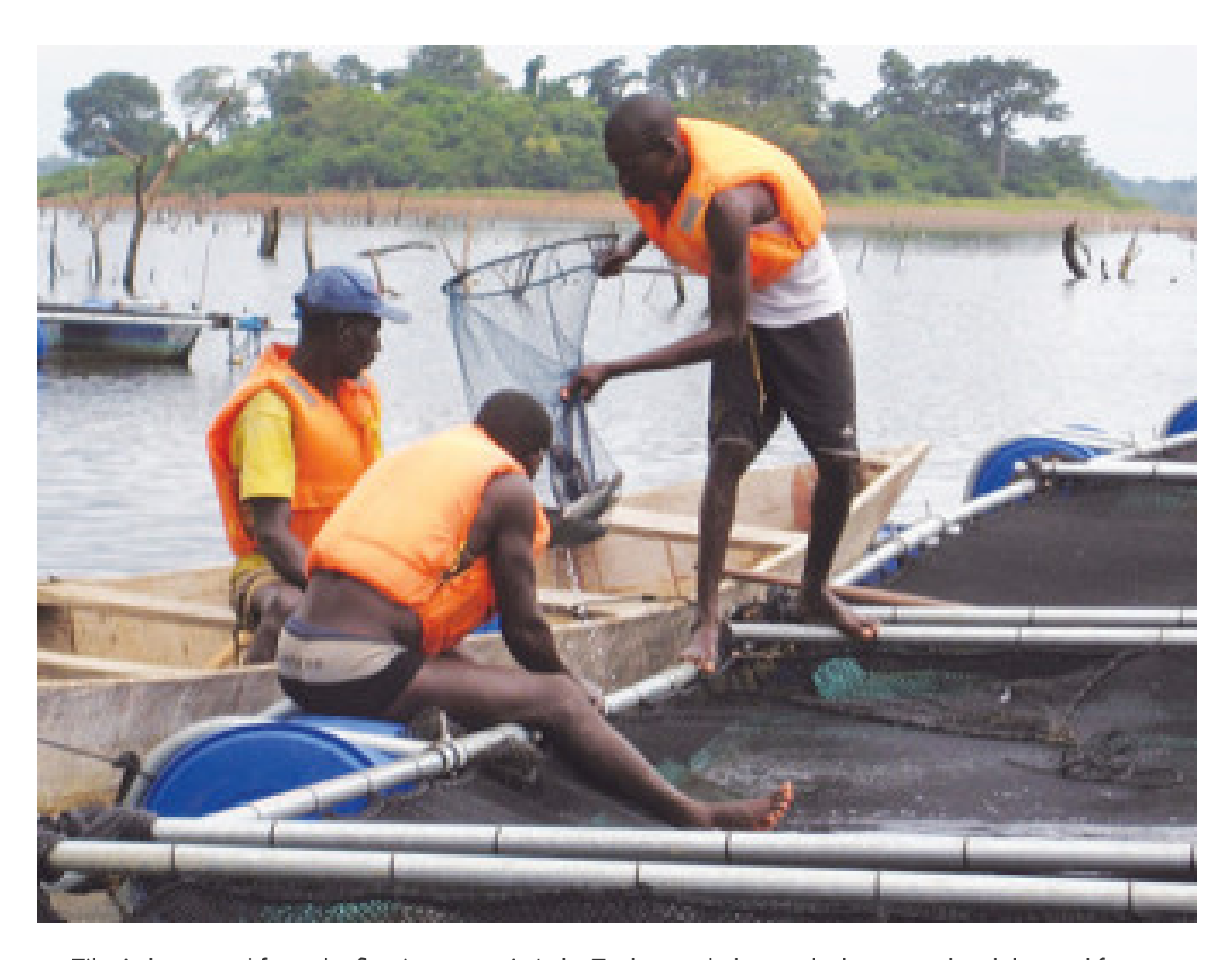
Tilapia harvested from the floating cages in Lake Taabo can help supply the strong local demand for fish, which currently is met largely by imports.

Currently, African aquaculture development may have reached a turning point, as a series of favorable events start to emerge. These include increasing aquatic product imports by many African countries, development of regional markets for freshwater fish and subsequent high market prices, the example of an established endogenous aquaculture food chain in Nigeria and the increasing number of large-scale private fish farms in several countries.