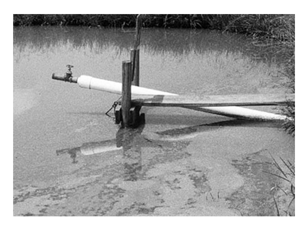
Unmanaged blue-green algae. Note uneaten feed in the scum.

Pond-based aquaculture systems worldwide typically have largely unmanaged phytoplankton algae populations. Negative impacts from these uncontrolled populations can provide a major production challenge, especially in intensive culture where the phytoplankton populations are dense and often dominated by cyanobacteria (bluegreen algae).