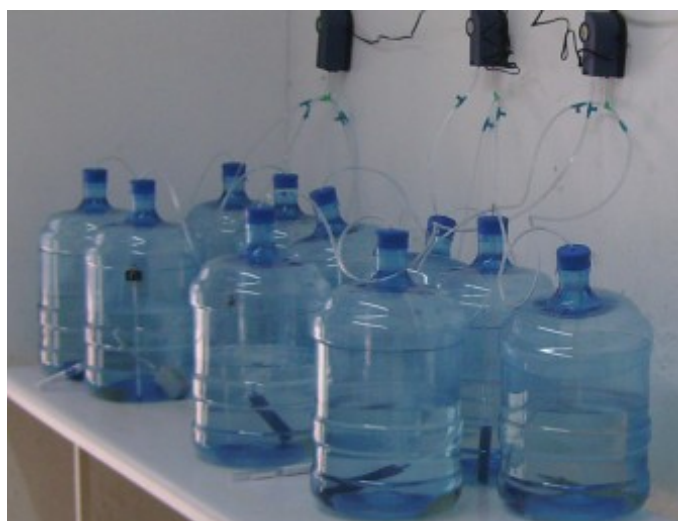
View of the experimental units used in the study.