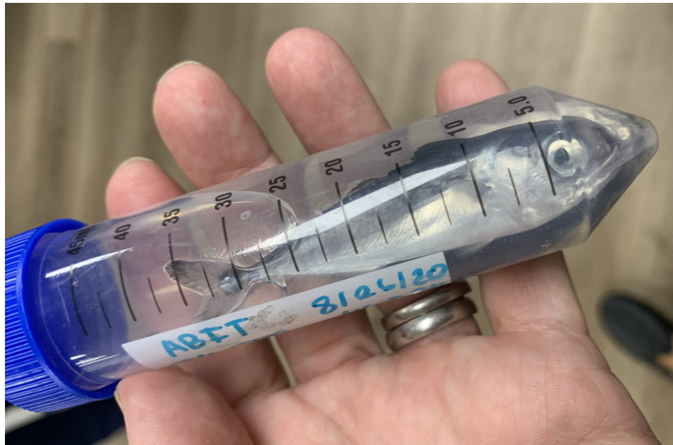
A young bluefin tuna taken for laboratory tests.

Ichthus Unlimited's proprietary feed has reduced the FCR to an impressive 4:1 ratio; is MSC-certified; helps reduce mercury levels in the final tuna product – a top concern among consumers; and increases the shelf life while maintaining desired texture and color.