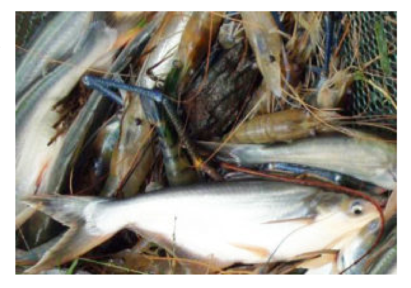
When raised in polyculture with freshwater shrimp, pangasius do not predate on the shrimp.

Research at Caribe Fisheries in Puerto Rico has determined that pangasius can