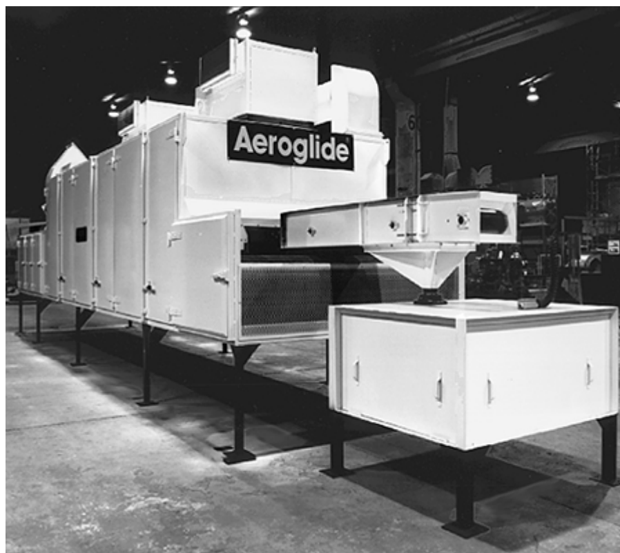
Fig. 2: Horizontal dryer.

Vertical coolers do not require much space, but compaction can occur with soft, moist feeds. Another disadvantage – also present in counterflow coolers and dryers – is that as pellets move in the direction of the flow, they rub against each other, which can generate a significant amount of fines. Excess fines must be screened out and reprocessed, which results in additional work and reduced efficiency for the plant.