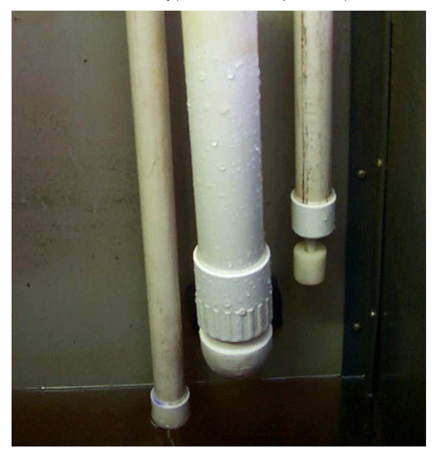
Process controls and monitoring can be surprisingly simple. This PVC pipe contains level switches for high and low level alarms in a pump sump (right) and a temperature sensor (left).

Intensive recirculation systems have the potential for a significant increase in production per unit volume of water, but at an increased risk of catastrophic loss due to equipment or management failures. In addition, the managers of these intensive production facilities need accurate, real-time information on systems status and performance in order to maximize their production potential.