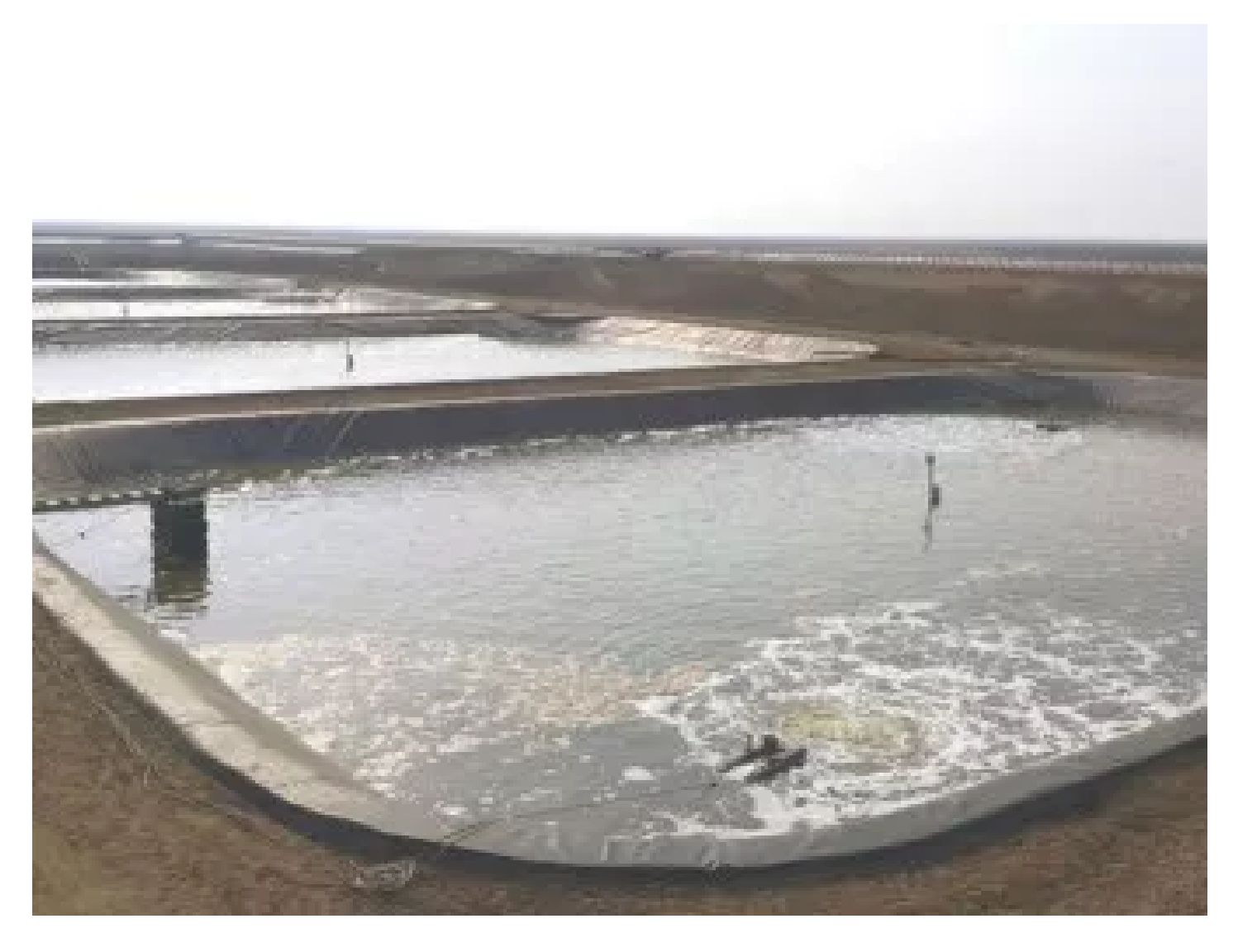
Four small R&D trial ponds were built and operated following a standard protocol for biofloc system culture of shrimp.

The pond water environmental conditions during the trial, if compared to similar technology systems in Asia, were considered to be extreme in terms of salinity and temperature. The salinity was maintained at between 42.0 and 49.5 ppt during the culture trial period. Other essential water quality parameters during the trial included water temperatures of 26.0 - 35.0^{\circ} C; pH 6.7 - 9.2; dissolved oxygen (DO) levels > 3.7; alkalinity 70 - 150 ppm; TAN 0 - 0.5 ppm; water transparency 9 -134 cm with biofloc levels of 2 - 3 ml/L.