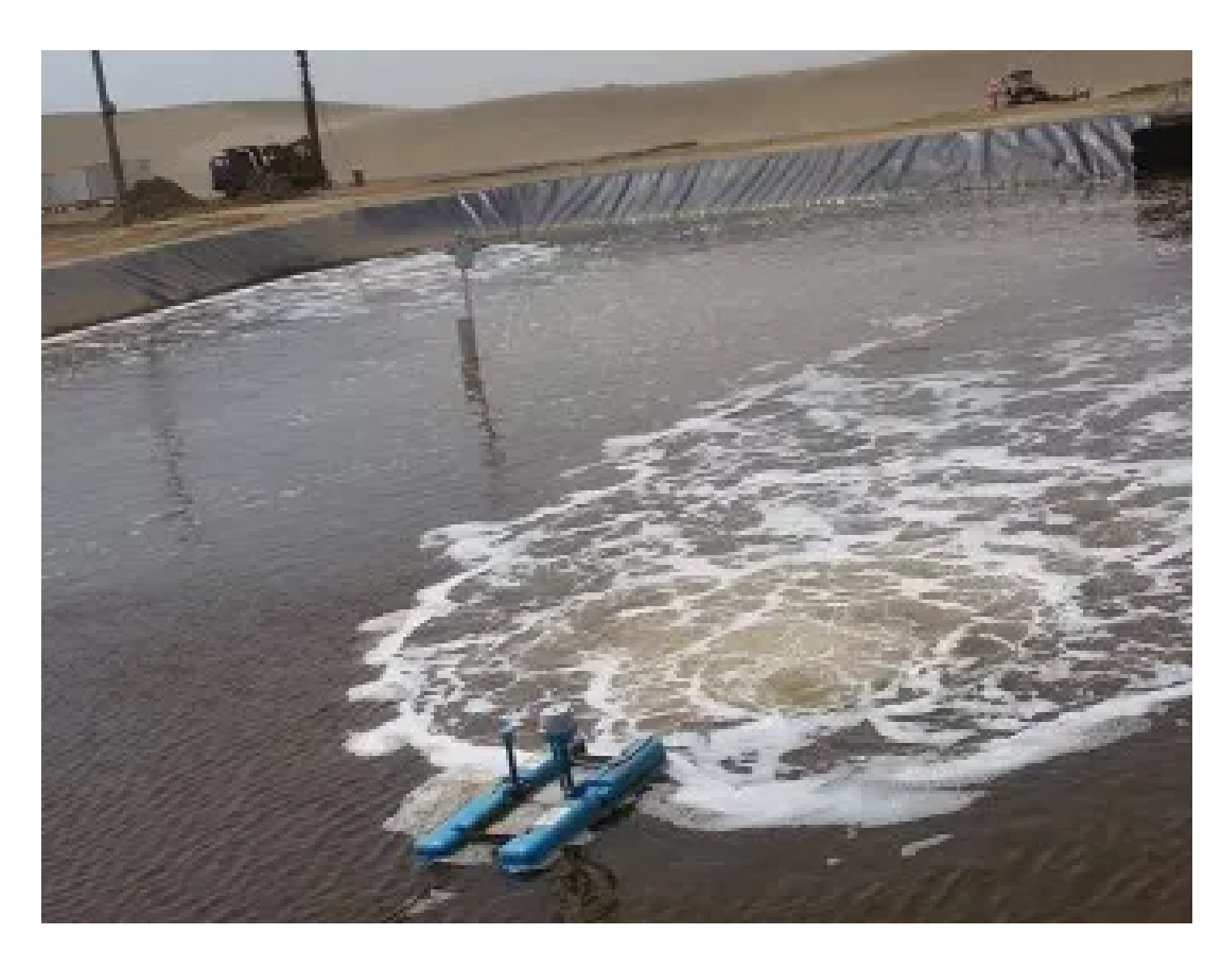
Each trial pond had aerators at opposite sides to create a smooth water current flow, maintain dissolved oxygen levels and accumulate sludge in the center for removal.