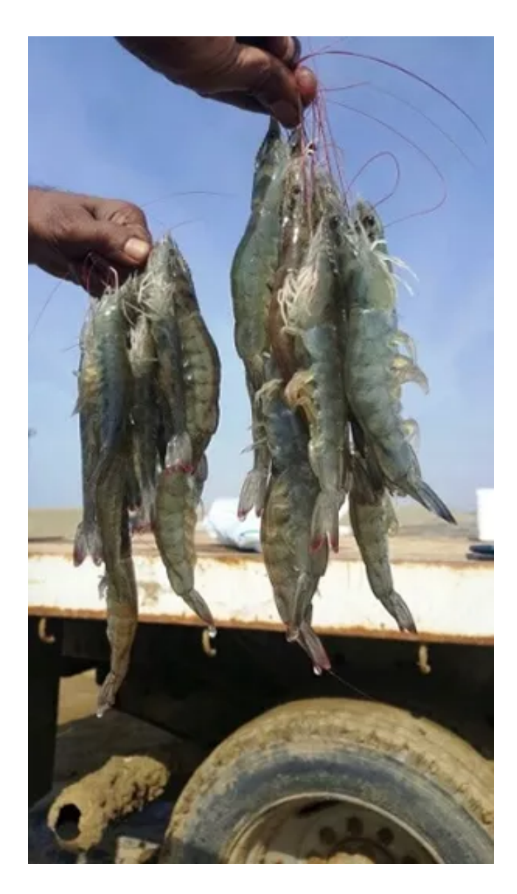
Shrimp harvested at the end of the RSACO trial.