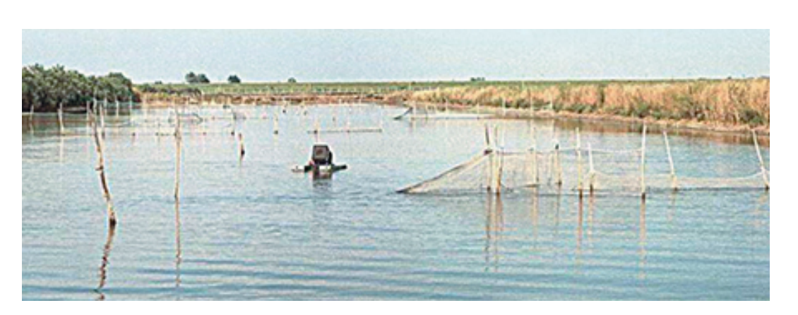
In Italy, typical earthen ponds use fyke-net traps for partial and final harvesting.

Recent research with M. japonicus has established an effective management protocol for production at three to four animals per square meter. This model includes the use of dry chicken manure as organic fertilizer during pond preparation, low waterexchange rates, and less-expensive compound diets to complement natural productivity.