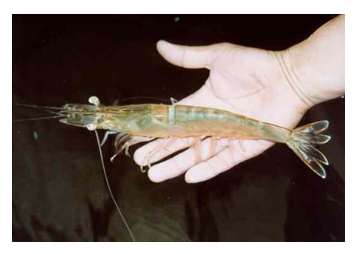
A ripe female P. chinensis. WSSV, HPV, and IHHNV have been reported in this species.