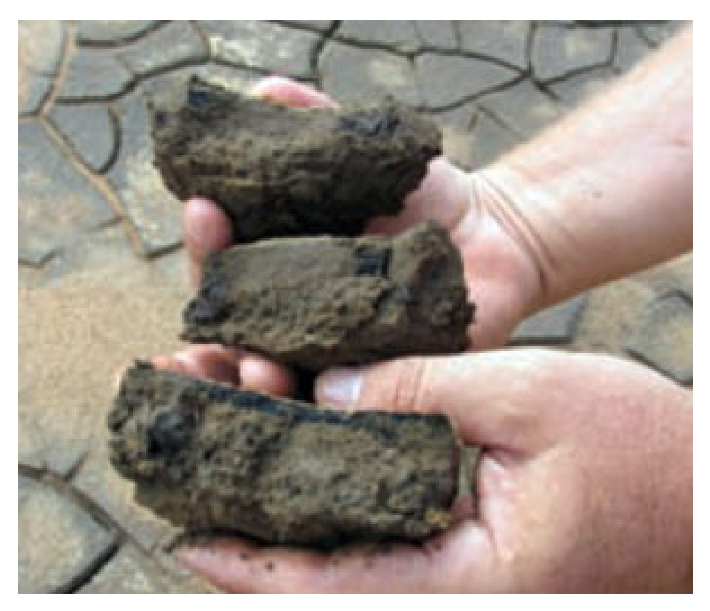
Ferrous iron and sulfide can react to form insoluble iron pyrite, which then precipitates in pond sediment.