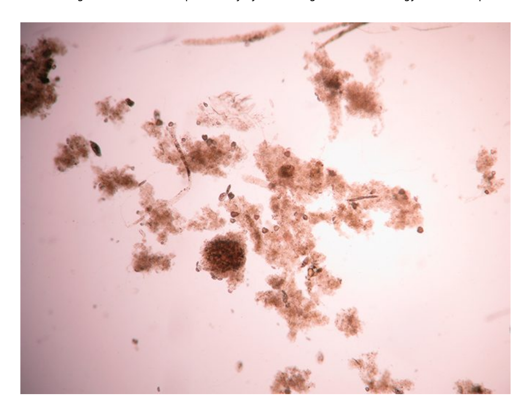
In BFT culture systems, bioflocs can be a food source for the cultured animals.