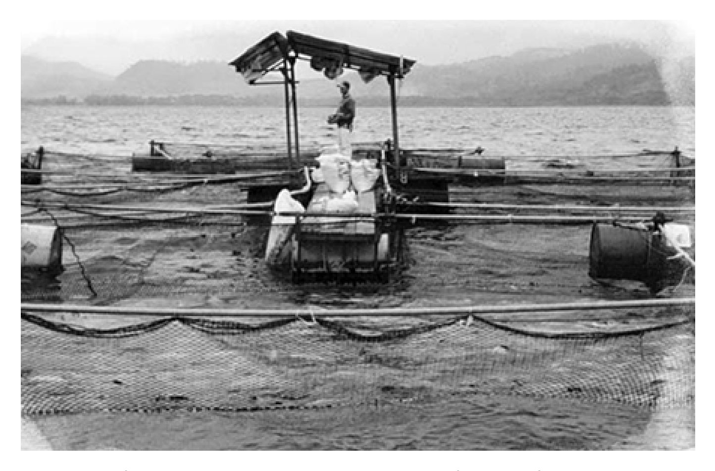
Fig. 1: Cages for tilapia culture in Honduras are typically suspended from a metal frame supported by drums.