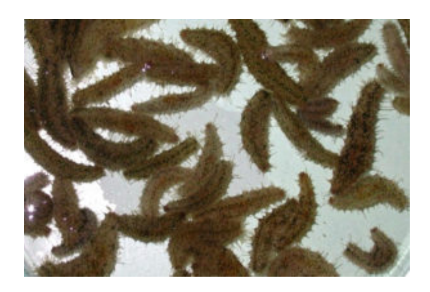
Juveniles spend about two months in the nursery phase.

Sea cucumber broodstock collected from the sea are induced to spawn in the hatchery, where the larvae are then cultured. The eggs hatch into Auricularia larvae within 48 hours after fertilization and start feeding on microalgae. The larvae then develop through the non-feeding Doliolaria stage before reaching the Pentacula stage. In 13 to 15 days, Pentacula animals are induced to settle in plates and are grown into juveniles. Early juveniles are maintained in the hatchery for one month and then for two months in the nursery.