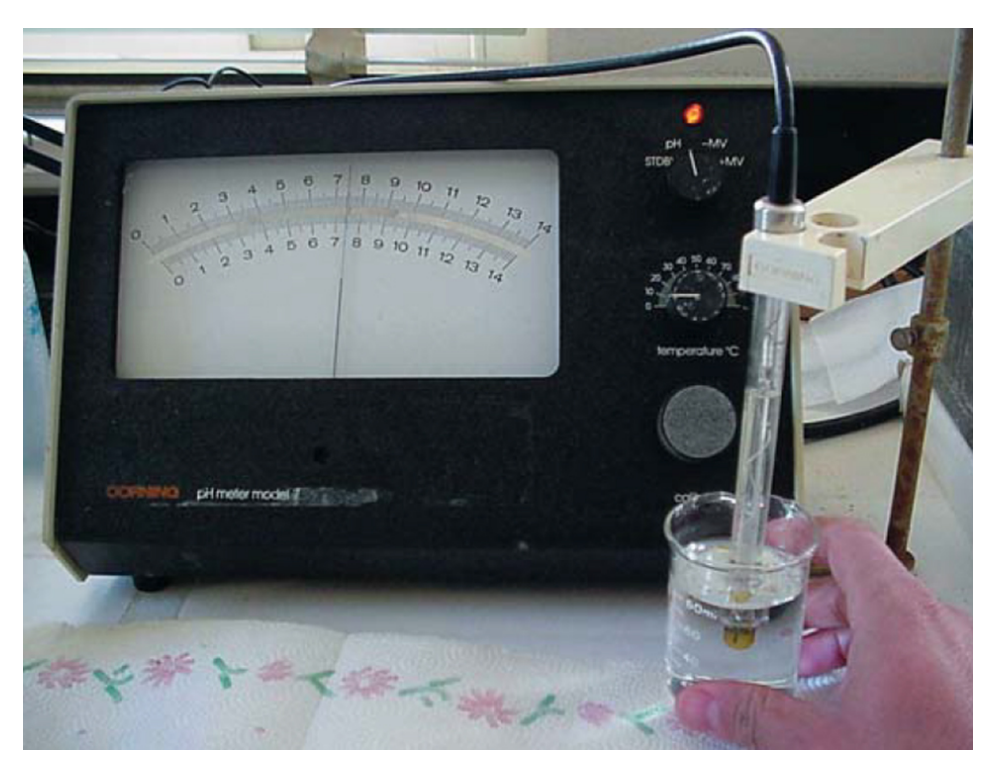
Fig. 2: The only reliable way of measuring pH is with an electronic pH meter.

A pH meter must be standardized before making measurements. Although it is customary to use a pH 7 buffer to standardize a pH meter, this procedure is not always reliable, for almost any pH meter can be adjusted to pH 7.0. The meter can be standardized at pH 7, but a second pH buffer one or two pH units above or below pH 7 should also be used to verify the meter will read another pH correctly after being standardized.