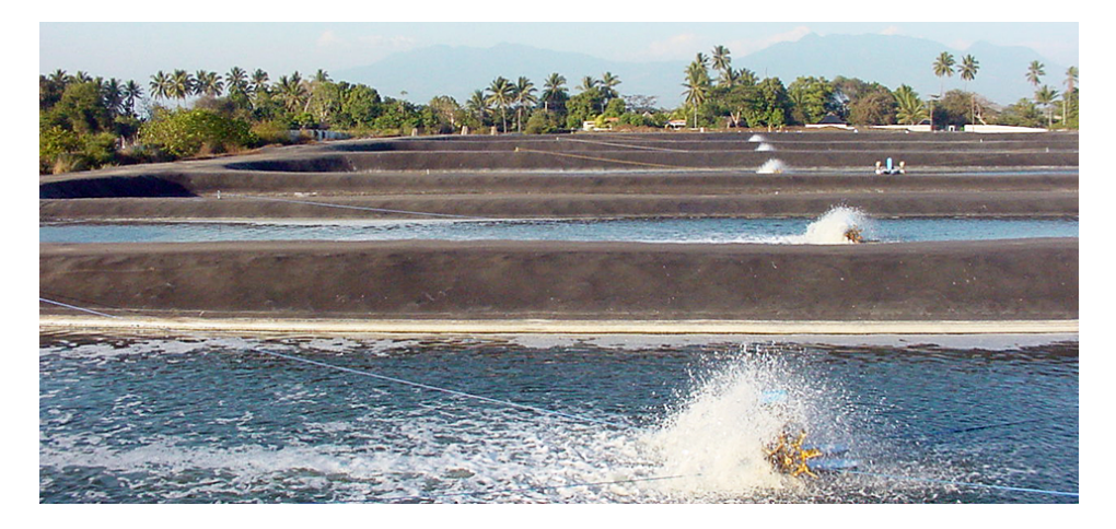
Mayasal S.A. evaluated postlarvae performance under commercial growout conditions at its farm in Guatemala.

In Guatemala, Taura Syndrome Virus (TSV) has negatively affected the shrimp-farming industry since 1994, reducing overall shrimp survival from 81 percent to 30 percent. To combat the disease, several farms in Guatemala began in 1999 to use domesticated, TSV-resistant postlarvae (PL) from Colombia.