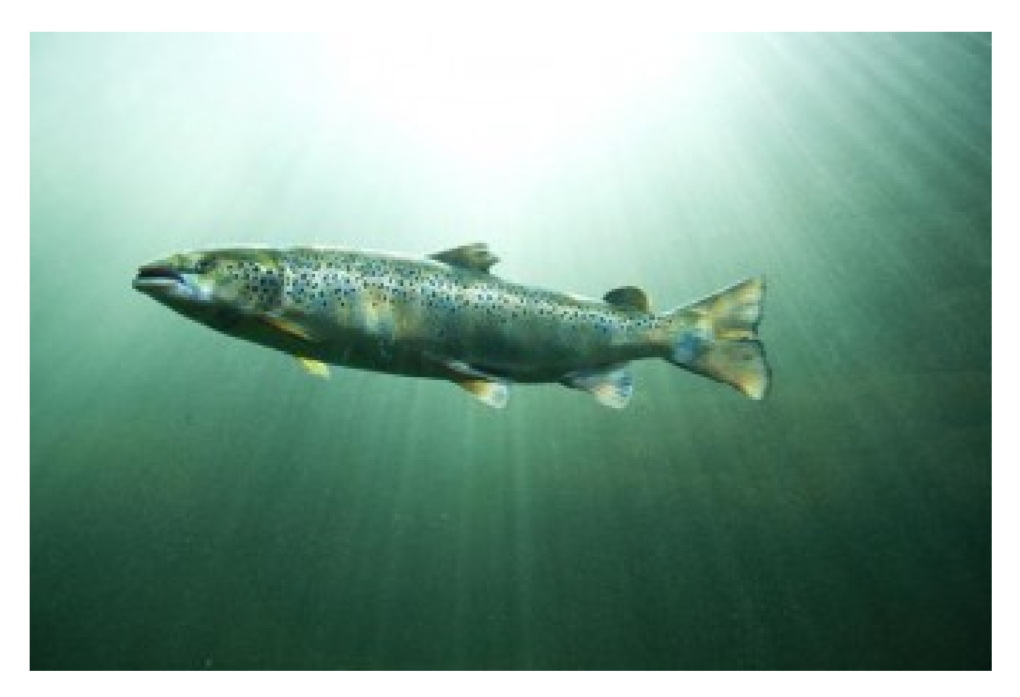
Maine-produced product is now an option for retailers and restaurant buyers who follow the Monterey Bay Aquarium's influential recommendations.

four-star [Best Aquaculture Practices]-certified salmon. This is an additional boost, one that opens the door to customers that follow Seafood Watch," Halse said. According to the aquarium's website, the guidelines have more than 900 business partners, companies that use the recommendations as a de facto procurement policy.