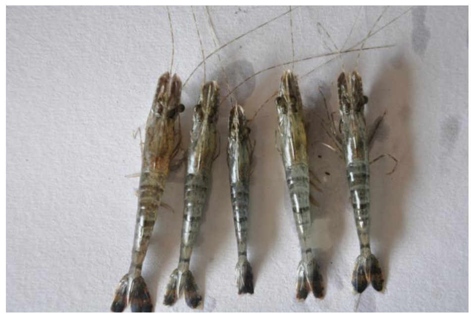
29-day old P. monodon