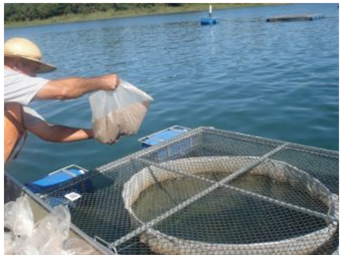
Feeding the tilapia during the trial.

The feed was prepared in a commercial extrusion feed line, and the additive was added in the mixer with the rest of the ingredients prior to cooking-extrusion. The animals were fed four times per day until they reached 170 g, and once the trial started, animals were fed three times per day. Any non-consumed feed was recovered and counted. No differences in terms of appetite were detected during the trial due to feed type. At the end of the trial, all fish were harvested, counted and weighed, and 5 percent of the animals in each treatment were checked and evaluated for their viscerosomatic indexes.