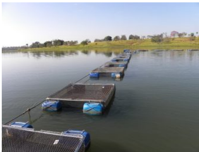
View of the tilapia cages used in the study.

In Nile tilapia ( Oreochromis niloticus ) farming – as in all fed aquacultured species – feed accounts for 60 percent of the total production costs. Increasing prices of raw materials has led nutritionists to search for alternative ingredients to reduce or at least maintain feeding costs. Meanwhile, as aquaculture production continues to intensify, disease is putting more pressure and presenting more obstacles to profitability. Best farming practices – including biosecurity, husbandry and functional feeds, adapted to each specific fish species and production challenge – are key for the optimal and profitable development of the industry.