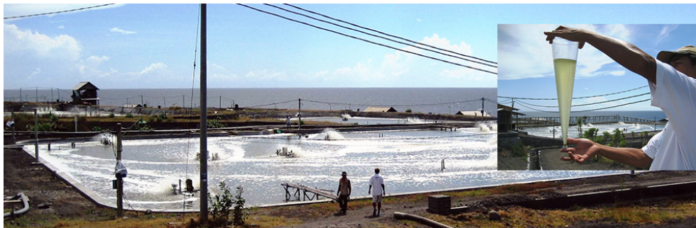
Smaller, concrete-lined ponds apply biofloc technology in Bali, Indonesia.

A crucial factor in the system is the control of bioflocs in ponds during operation. In raceways, settable solids wastes are removed outside the raceway. However, in large ponds, paddlewheel aerators need to be positioned to concentrate solid waste at the pond center for draining or other area for siphoning out. The suspended bioflocs are maintained at less than 15 mL/L during operation. The carbon:nitrogen ratio is controlled and kept over 15:1 by adjusting molasses, grain and feed inputs.