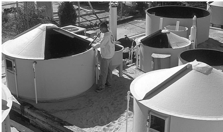
Fig. 3: Outdoor controlled-environment broodtanks for southern flounder at UNC-Wilmington.