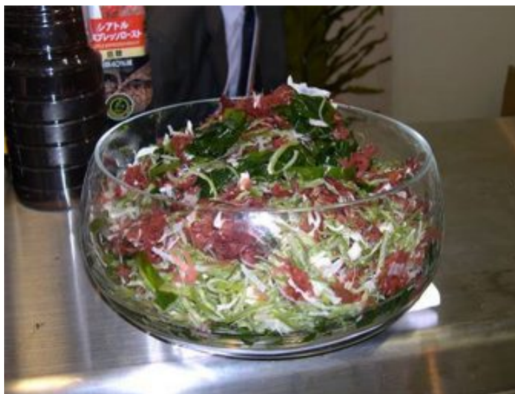
A bowl of fresh salad with macroalgae in Kobe, Japan.

A Japanese proposal by Prof. M. Notoya and co-workers can have macroalgae growing on 100-square-kilometer floating rafts, located away from commercial shipping lanes until ready for harvest and using artificial ocean nutrient enhancement. Each of these giant rafts could possibly produce 10 6 tons (fresh weight) of macroalgae a year. Matching current global agriculture output with macroalgae will therefore require around 10,000 such rafts and will cover 1,000,000 square kilometers of oceanic area, a mere 0.3 percent of the oceans of the world.