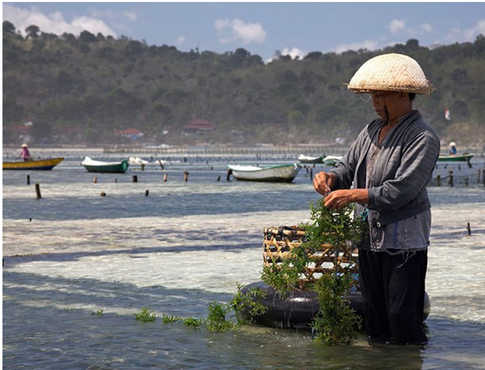
A seaweed farmer in Nusa Lembongan gathers edible seaweed that has grown on a rope.

A global focus on macroalgae and marine plants will result in many jobs and increased food security