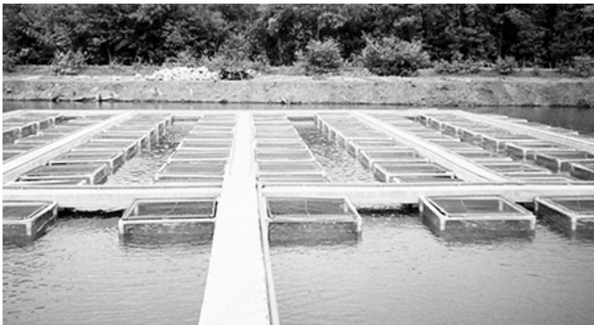
Fig. 1: The growth trial was conducted using bottomless cages in a single 0.32-ha pond.

Variability in the severity of white spot syndrome virus outbreaks can be correlated to seasonal and environmental factors, suggesting an interaction between the disease and stress factors. In some cases, shrimp survive exposure to WSSV, but the presence of additional stress factors can cause an acute outbreak of the disease.