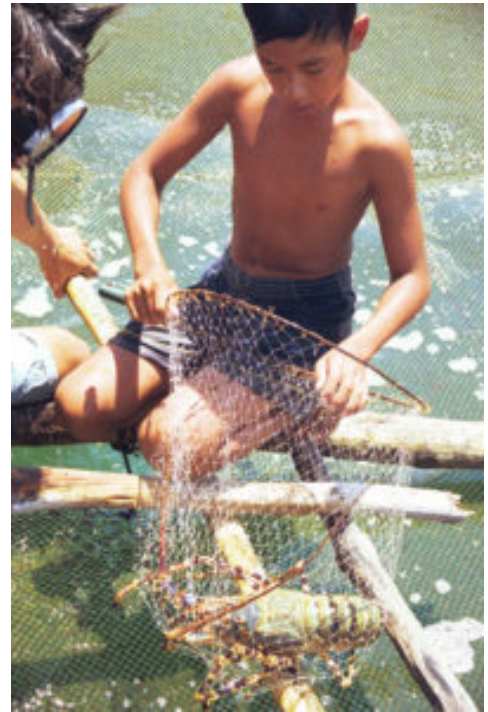
Cultured lobster at harvest size.

Results from this experiment suggested the poor performance in animals fed mussels was not due to an insufficient supply of carotenoid, but other nutrient problems – perhaps cholesterol deficiency or increased vitamin loss due to the prior freezing of the mussels. In contrast to other studies with temperate spiny lobsters, frozen mussels were found unsuitable as a sole diet for tropical spiny lobsters.